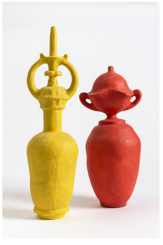
Clare Burnett, The Museum Series (Shepherds Bush), 2021